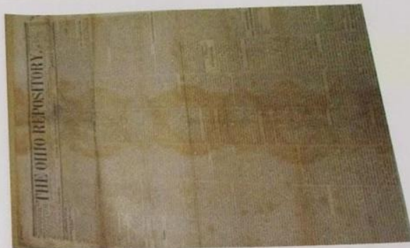
BC 2957.2 'Ohio Repository' Jan. 4, 1854.JPG