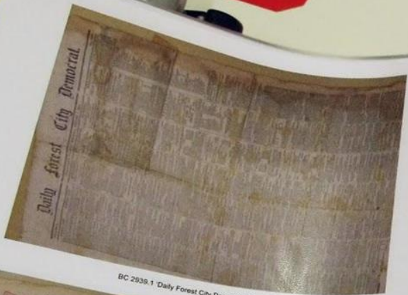
BC 2939.1 'Daily Forest City Democrat' 1854.JPG