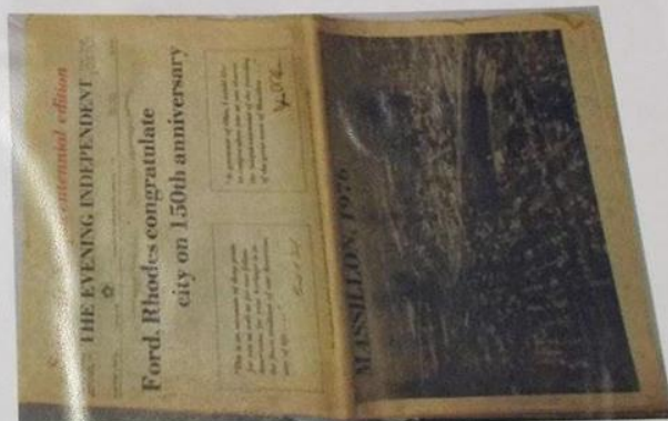
The Evening Independent Sesquicentennial Edition Sept. 4, 1976