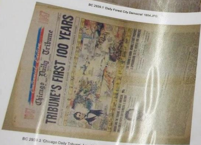
BC 2932.3 'Chicago Daily Tribune' Jun. 10, 1947 'Tribune's First 100 Years' Centennial.JPG