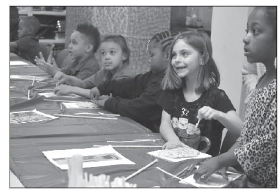
Children learned to use senses beyond their sight during a Blind Spot activity. _{AO}