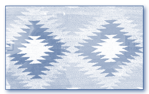
Eye Dazzler woven wool rug (detail), c. 1900–1930 Judith Paquelet American Indian Gallery

The final exhibition of the year was INTO LIGHT Project Ohio: Continuing the Conversation. The exhibit, on display November 12 through January 4, 2023, presented drawings of Ohio individuals who have lost their lives to drug addiction. INTO LIGHT Project is a national nonprofit organization documenting the tragic loss of human life from the disease of drug addiction. Their exhibitions feature narratives based on interviews with surviving loved ones, along with detailed graphite portraits. The black and white medium serves as an intentional metaphor for the fact that every life includes both light and dark moments. EV & ST