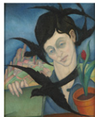
Todros Geller Untitled 1929