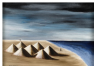
Gertrude Abercrombie Untitled 1939