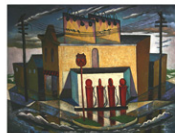
Santos Zingale White Station 1948